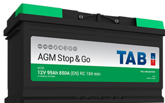
Base hold down