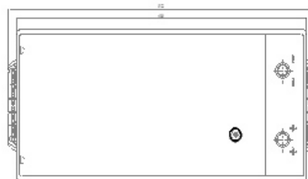
Base hold down